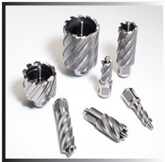
All cutters come complete with a center pin.

Machines shown without permanent safety guard for marketing purposes only.