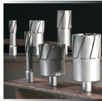
Carbide and Metric size cutters available.